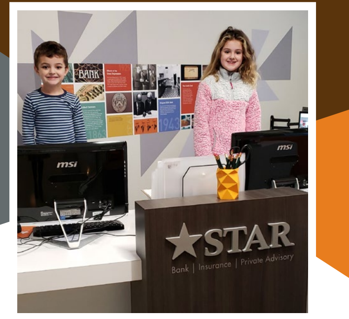
Aspiring young bankers at the STAR "branch" in JA BizTown.