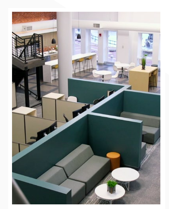
The Monument Circle Financial Center offers an open space, state-of-the-art environment.