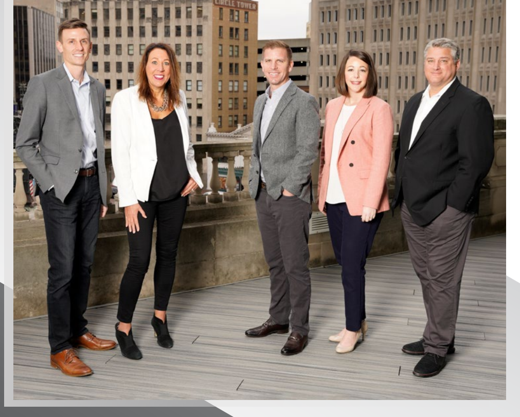
The Face of Banking

STAR Bank was featured in Indianapolis Monthly magazine as The Face of Banking.